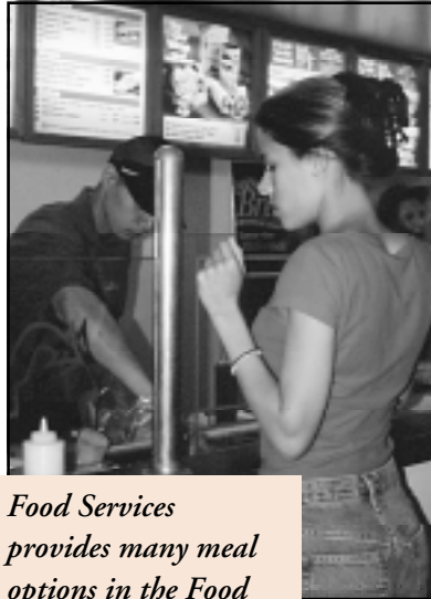
Food Services provides many meal options in the Food Court.

The Association is governed by a board of directors. Surplus funds generated in excess of required reserves for working capital, capital replacements, and future operations are used for the benefit of the entire campus. When you see the following facilities and services, think of the California State University, Fresno Association, Inc.: