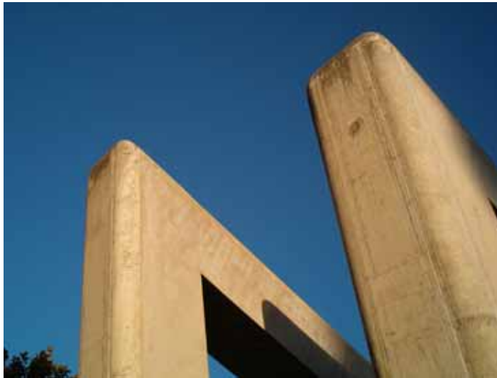
"Sweet Sixteen" by Greg O'Halloran (1974) sculpture located at Fresno State