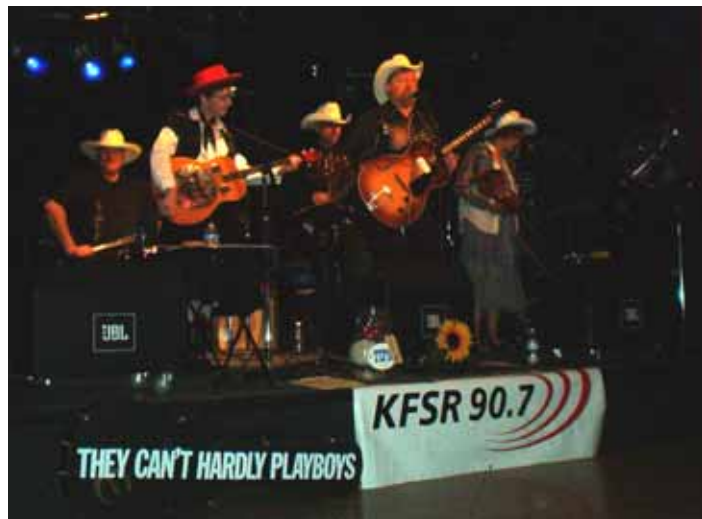
"They Can't Hardly Playboys" perform at the Starline, October 3rd