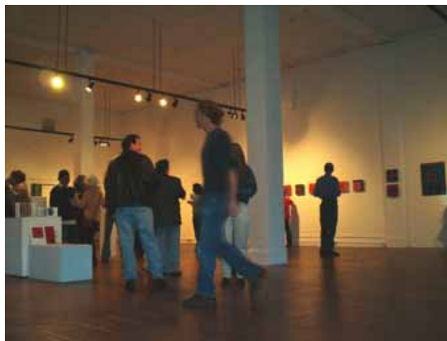
Fresno's cultural and creative scene thrives with Art Hop and KFSR helps to lead the way

But our efforts aren't limited to music programming. As you'll soon read, this summer we're launching a series of weekly readings by world class poets, recorded over the last few months, right here in Fresno (the San Joaquin Valley is known worldwide for its poets). KFSR is also once again working with the San Joaquin River Parkway this summer on